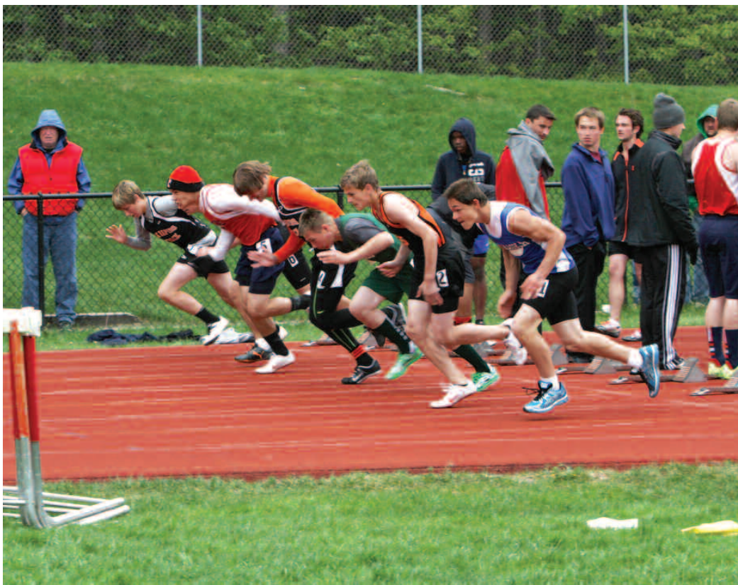
A group of runners burst from the starting line in a qualifying heat of the 100 meter dash at the Lake Michigan Conference Track meet in East Jordan.