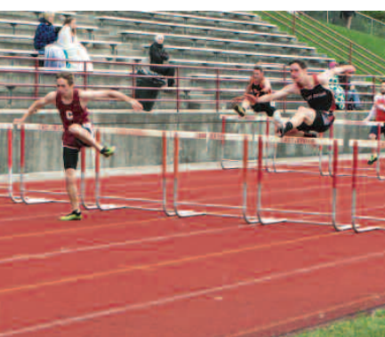
Flying over the Mens 100-meter hurdles these runners from Charlevoix, East Jordan, Harbor Springs and Boyne City push to the finish line Tuesday during the Lake Michigan Conference track meet at East Jordan High School.