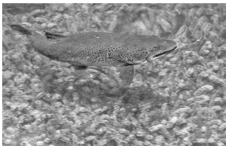
The habits of huge brown trout were studied for two years by a team of researchers from Grand Valley State University with the help of dozens of volunteers.